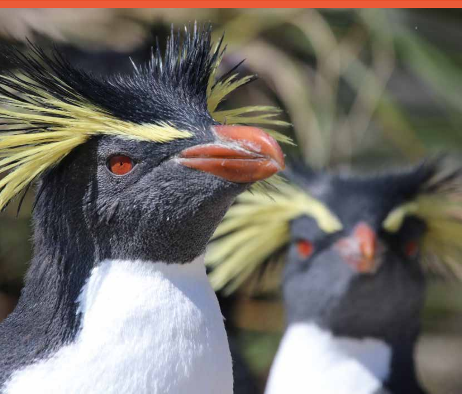
Tristan da Cunha is a globally important breeding site for the endangered northern rockhopper penguin.

The marine manager portal includes open, public dashboards and private, collaborative workspaces. The workspaces provide everyone with interactive tools to generate spatial and time-series analysis and data visualizations, upload static layers and time-series data, and download all data for advanced research techniques.