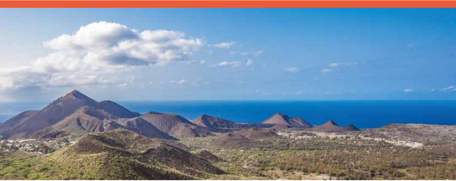
Ascension Island.

“Global Fishing Watch’s marine manager portal enables us to harness the power of big data to monitor, understand and manage the entire 170,000 square miles of Ascension Island’s marine protected area. Data has the potential to revolutionize our ability to protect marine environments, and with Global Fishing Watch’s support, we now have the capability to capture and analyze such large amounts of information. Global Fishing Watch involved us from the beginning to ensure the portal’s design meets our particular management needs. The outputs are so intuitive and beautiful that they serve not only as a vital management resource but also as a compelling engagement tool that connects the Ascension community and global public with one of the most remote areas of the ocean.”